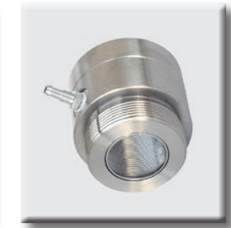
Air purge when cooling not required Model Sprint 8-P