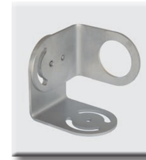
Dual axis mounting bracket Model Sprint 8-DM