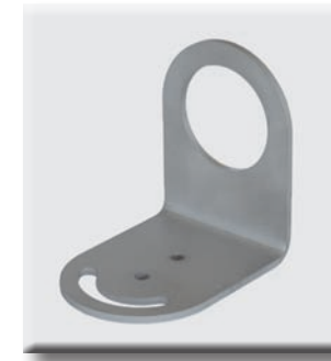
Single axis mounting bracket Model Sprint 8-SM