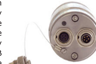
Sprint 8 rear showing Signal and Programming connections

A USB configuration interface on the rear of the Sprint 8 allows configuration of Temperature measurement span, Emissivity, °F or °C reading and Response speed. In research and laboratory environments the Sprint 8 can be operated exclusively over its USB connection to the supplied EasySpot for Windows interface software.