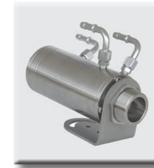
Cooling jacket incl. air purge unit & bracket Model Sprint 8-JP