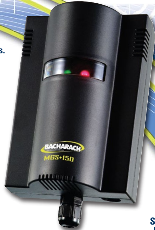
MGS Standard Housing