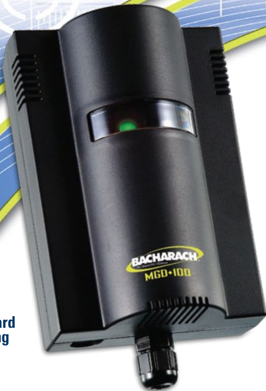
MGD Standard Housing

Ideal for Chiller Rooms, Supermarkets, Brewing and Bottling Facilities, Industrial Refrigeration, Arenas, Food Storage and Processing Facilities.