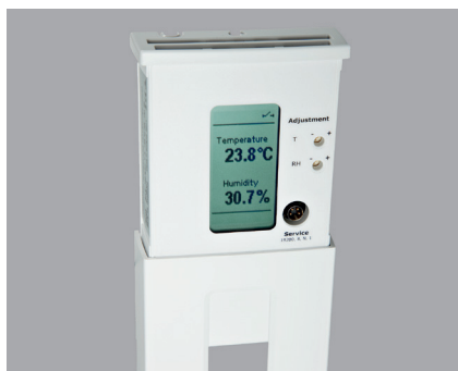
The sliding cover exposes offset trimmers and service port for calibration.

On-site calibration and adjustment is exceptionally easy. The sliding lid exposes offset trimmers for 1-point calibration of both humidity and temperature parameters. The included display makes adjustment clear and