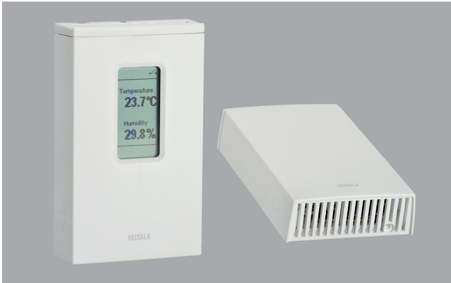
The HMW90 Series Humidity and Temperature Transmitters are designed for demanding HVAC applications.

The wall-mounted Vaisala HMW90 Series HUMICAP® Humidity and Temperature Transmitters measure relative humidity and temperature in indoor environments, where high accuracy, stability, and reliable operation are required.