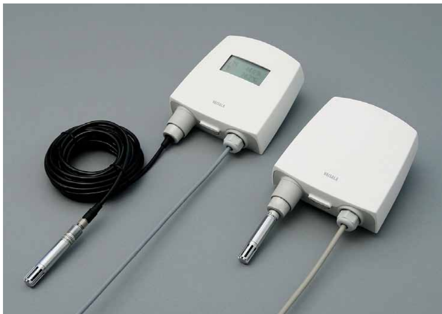
The HMT120/130 with and without a display.

The Vaisala HUMICAP® Humidity and Temperature Transmitters HMT120 and HMT130 are designed for humidity and temperature monitoring in cleanrooms and are also suitable for demanding HVAC and light industrial applications.