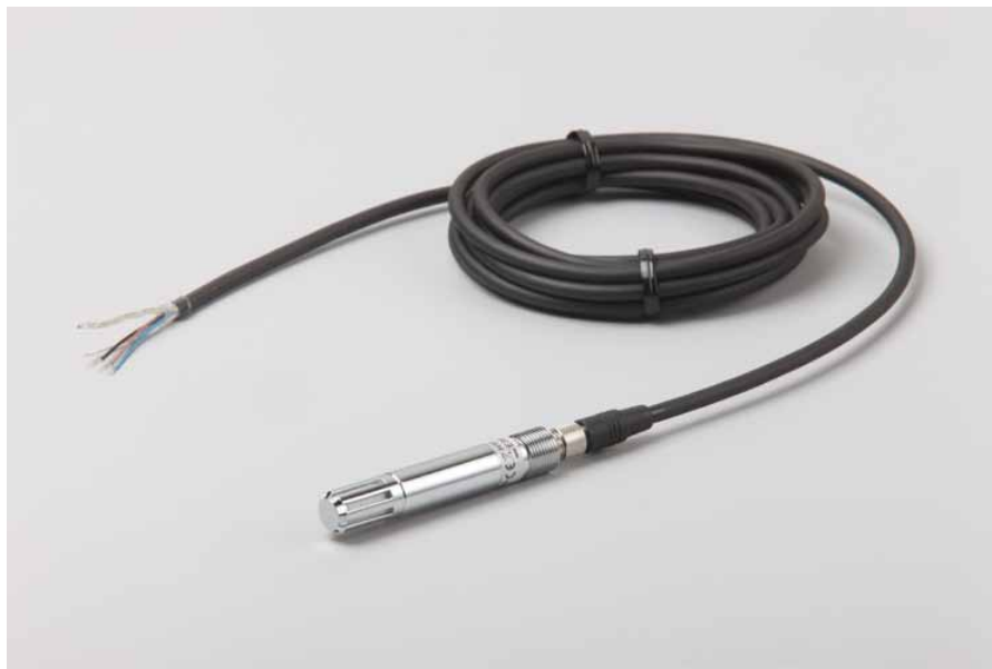
The HMP110 with excellent stability and high chemical tolerance.