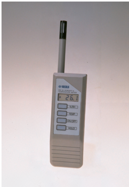
The Vaisala HUMICAP® Hand-Held Humidity and Temperature Meter HM34 provides accurate spot checks of humidity and temperature.