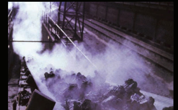
Hot Coke Conveyor