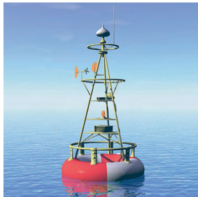
The PTB110 can be used in data buoys.

The compact PTB110 is especially ideal for data logger applications as it has low power consumption. Also an external On/Off control is available. This is practical when the supply of electricity is limited.