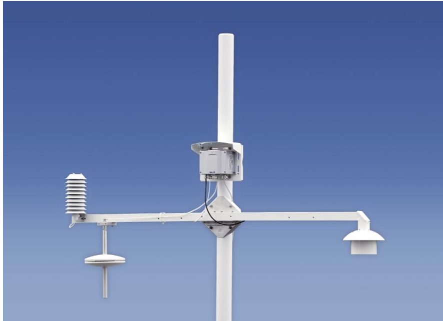
The HMT337 with warmed probe installed with the HMT330MIK kit is the right choice for reliable humidity measurement in humid weather conditions.