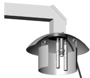
For calibration, a portable HMP77 reference probe is easy to attach beside the HMT337 probe.

Obtaining a true humidity reading is particularly important e.g. in traffic safety: at airports and at sea as well as on the roads. It is essential, for example, in fog and frost prediction.