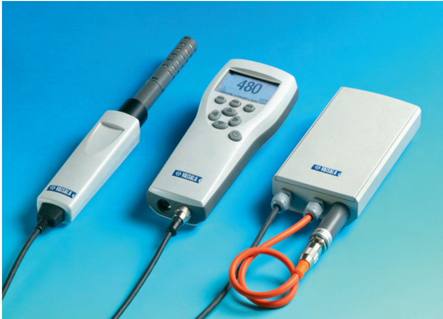
The Vaisala CARBOCAP® Hand-Held Carbon Dioxide Meter GM70 is the demanding professional's choice for hand-held carbon dioxide measurement. The meter consists of the indicator (center) and probe, used either with the handle (left) or pump (right).

The Vaisala CARBOCAP® Hand-Held Carbon Dioxide Meter GM70 is a user-friendly meter for demanding spot measurements in laboratories, greenhouses and mushroom farms. The meter can also be used in HVAC and industrial applications, and as a tool for checking fixed CO 2 instruments.