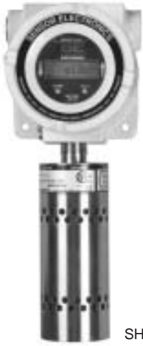
SHOWN WITH SEC MILLENIUM SENSOR